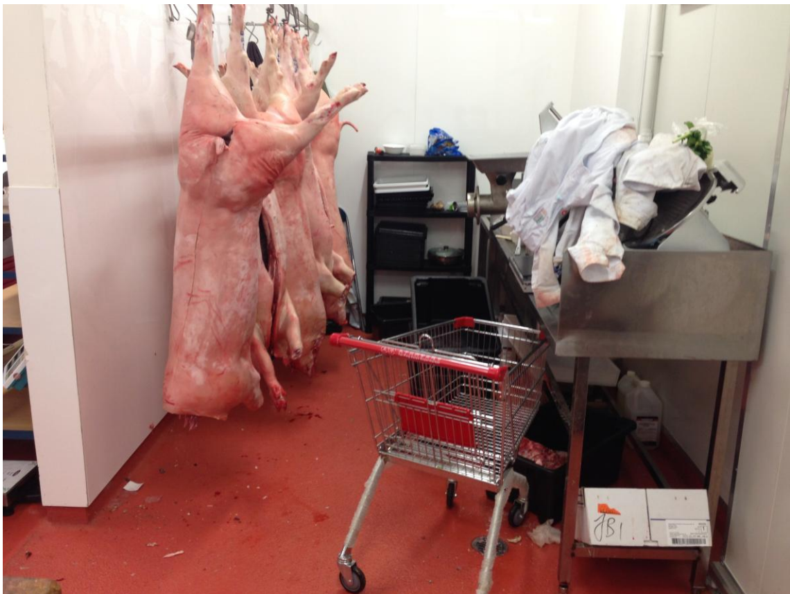
Armepoxy Flooring System installed in Butchery and BBBQ Areas