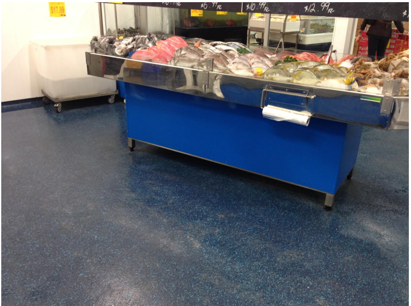
Special Finishes Liquid Granite Flooring System

The outcome is a completed project with excellent flooring systems specifically selected to suit the environments they are installed in.