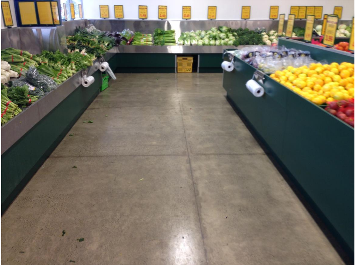
Special Finishes Ultrathane MC applied over polished concrete floor